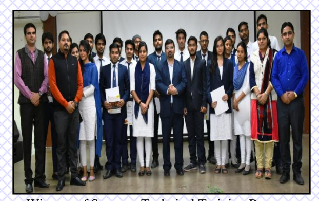
Winners of Summer Technical Training Program

On the basis of weekly quizzes, held during Summer Technical Training Program; Department of CEA awarded the winners with goodies and certificates. The Summer Technical Training Program was started for BTech (CSE) second year students to polish and enhance their skills in 'C' programming language. All participants were provided the study materials during training program as well.